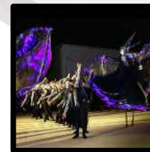
Birth Of Light