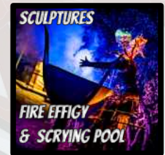
SCULPTURES FIRE EFFIGY & SCRYING POOL