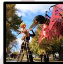
The Chimera & The Wishing Tree