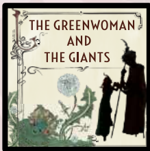
THE GREENWOMAN AND THE GIANTS