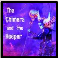
The Chimera and the Keeper

Interactive and illuminated characters to add a shimmer or shine to your event or festival.