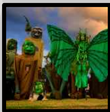
ELEVATE - Walking with Giants