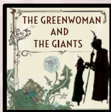
THE GREENWOMAN AND THE GIANTS