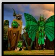
ELEVATE - Walking with Giants