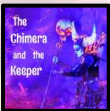
The Chimera and the Keeper

Interactive and illuminated characters to add a shimmer or shine to your event or festival.