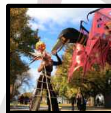
The Chimera & The Wishing Tree