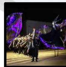
Birth Of Light