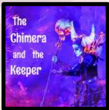
The Chimera and the Keeper

Interactive and illuminated characters to add a shimmer or shine to your event or festival.