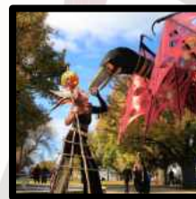
The Chimera & The Wishing Tree