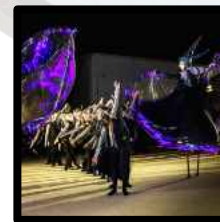
Birth Of Light